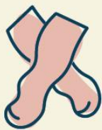
PAIR OF STOCKINGS