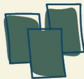
NORI SEAWEED (4 SHEETS)