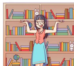
The school redeems Scholastic Rewards for additional resources