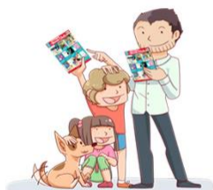
Families order from Book Club.

Every purchase you make earns your child's school 15% of your order value in Scholastic Rewards that can be used to purchase valuable educational resources that benefit your child.