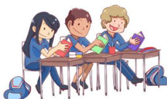
The school earns Scholastic Rewards.